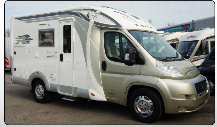
Made with 45 years of experience with all the style and elegance you would expect from Italy.