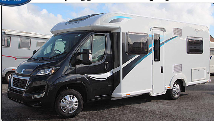
A brand new improved model range for 2015 with innovative Alu-tech build technology and new Peugeot facelifted cab.