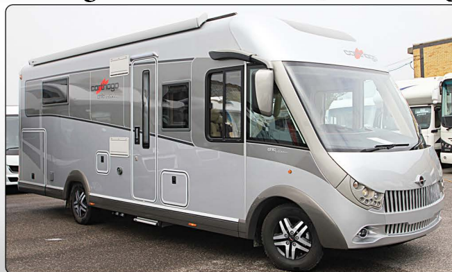
New Carthago Chic e-line I 51 QB "Yachting" Motorhome, 3 berth 7.855metres long luxury A class with rear island bed over garage and wrap round overhead cupboards over cab.