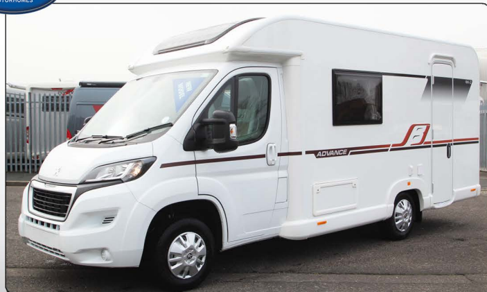
Massive 2018 specification at a "great price"

New Bailey Advance 66-2 Motorhome. 2 berth, 2 travelling seats 6.593 metres long low profile with twin side couch front lounge, seating converts to sleeping as two singles or a double bed.