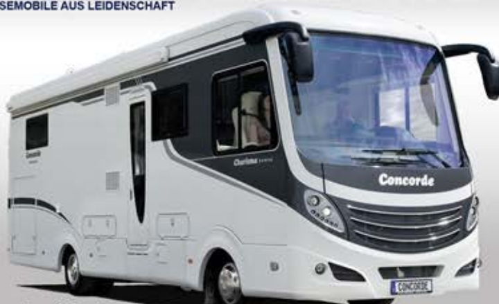
Concorde's 'New premium' A class.

New Concorde Charisma III 900 M Motorhome. A class 4 berth 9.09metres long A class with rear Queen island double bed and drop down large double bed over cab.