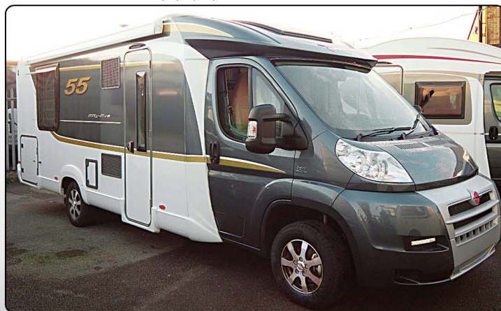
New special edition 2014 model with "Huge" standard specification at one price.

New Büirstner Nexxo t 740 "fifty-five" Edition Motorhome, 2 berth 7.39metres long low profile with rear fixed island double bed and front L shape lounge.