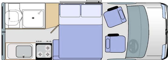
Artists Impression (Layout plans are not to scale) ©