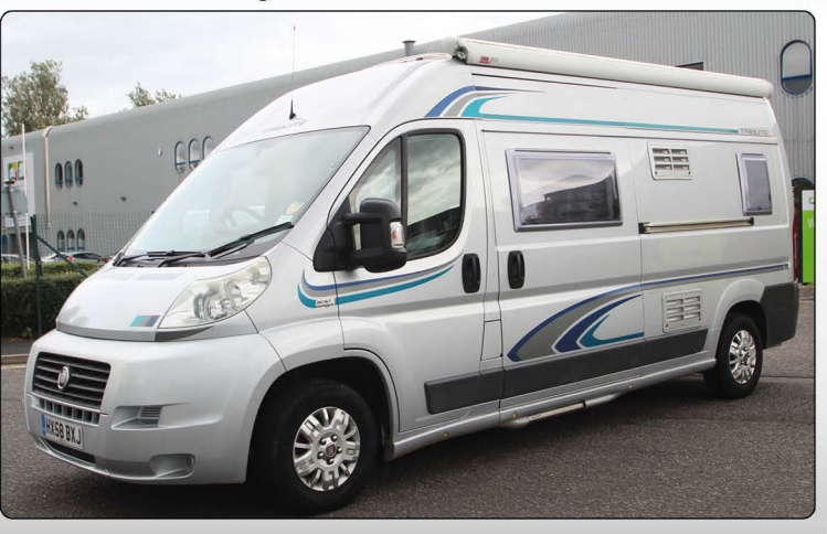
Used Trigano Tribute 650 Motorhome. 2 berth, 5.99metres long van conversion with large side sofa converting into double bed.

Fiat Ducato 2.3L 120 Multijet diesel. 6 speed manual gearbox, 40,460km. Chassis plated at 3300kg GVW. Right hand drive, Cab air conditioning, Electric windows, Central locking, Electric mirrors, JVC radio/CD and Integrated cab blinds. Body finished in Silver metallic. Lounge with Twin swivel front cab seats, Large side sofa converts to double bed, forward facing side seat with additional travel seat belt, Over cab locker storage, Removable dining table, Large Heki roof light, TV bracket and aerial point. Rear galley kitchen, Oven and grill with 4 burner gas hob, Dometic Fridge/freezer, Midi roof vent, Stainless steel sink. Webasto heating. Truma gas water heater. Wet room with separate shower partition, Thetford cassette toilet, Vanity unit with integrated sink and small roof vent. Large rear wardrobe. Status aerial. Solar Panel, Roof rails, Rear ladder, Bike rack, Alloy wheels, Electric step and Fiamma F65 awning. (HX58BXJ –/08).