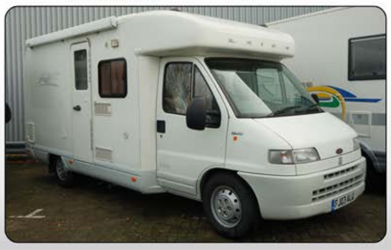
Used Laika Ecovip 7.1 Motorhome, 4 berth 6.066metre long low profile with fixed rear French double bed and L shape front lounge.

Fiat Ducato 18 LWB 2.8 JTD diesel. 5 speed manual. 1 owner, Plated at 3500kg GVW, Electric mirrors, Electric windows, Central locking, Blaupunkt CD/Radio. Lounge comprising Passenger swivel front seat, Large L shape lounge sofa, 2 additional seatbelts, Freestanding dining table with folding leaf and drop down facility, TV cabinet with roller shutter door and slide out TV bracket, Habitation sound speakers, Over cab storage cabinets and Large roof vent. Galley kitchen with Stainless steel sink with glass hinged cover, Smev 3 gas burner hob, Smev rotisserie gas oven and grill, Electrolux 104L fridge/freezer. Midi roof vent over rear French bed. Large rear double door wardrobe. Truma gas blown air heating. Wetroom with Sliding entrance door, Thetford cassette toilet, Washbasin with vanity unit, Midi roof vent and Shower curtain. Electric step. Rear ladder. Roof rails and Crossbars. 3.0metre Omnistor awning. Flyscreen door. External aerial. (FJ03ALU – 05/03)