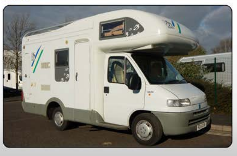
Used Knaus Sun Traveller 504 Motorhome. 4 berth 5.68metres long coachbuilt with fixed double bed over cab and rear bathroom.

Fiat Ducato 2.8 JTD 128ps diesel engine, 5 speed manual gearbox, 37,267 miles, Plated at 3500kgs GVW, Electric windows, Electric mirrors, Sony CD/Radio, Side steps to cab doors, Goldschmitt air suspension to rear axle. Lounge comprising double dinette with 4 additional seatbelts, Newly upholstered including cab seats in Beige velour, Drop down dining table, Concertina pull down blind to front cab area, Panoramic Heki roof light, Habitation loud Joudspeakers, TV cabinet with roller shutter door with power point, Separate TV swing arm bracket in lounge and Removable fitted carpets. Over cab large double bed with Pull up security/privacy blind, Removable access ladder and Midi roof vent. Galley kitchen Smev 3 burner gas hob unit, Stainless steel sink with drainer and glass hinged cover, Smey gas oven, Electrolux 104 litre fridge/freezer and Hob extractor fan. Truma gas blown air heating. Wetroom with Rotating shower screen, Thetford cassette toilet, Vanity unit with integrated washbasin and Roof fan. Large rear wardrobe and storage cupboards. Rear ladder and Roof bars. Fiamma 2 bike rack. Integrated 3metre Fiamma roll out awning. External tall ski/storage locker. Flyscreen door. (FG51XXM - 10/2001)