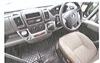
It has a deluxe Pioneer stereo and Chassis Pack extras