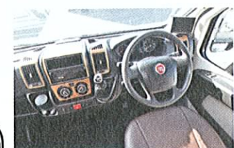
Spot the reversing camera, air con and passenger airbag