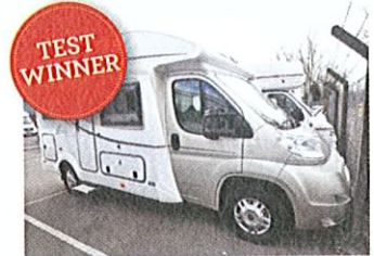
This Ixeo has Champagne cab paint and reversing sensors