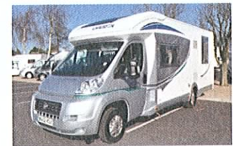
The Suite Relax has an awning, rear rack and luggage box